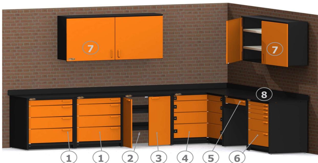
Pre-Configured Units or Mix & Match Modular Units to create your own Modular Stationary Workbench

The Modular Series from Swivel allows you to build a stationary workbench to suit your needs in 2.5 foot increments - from 2.5 feet to whatever length you need. Add in shelves, a single drawer workstation, or if you want to maximize your workbench storage space leading into a corner add the exceptional Lazy-Swivel™!